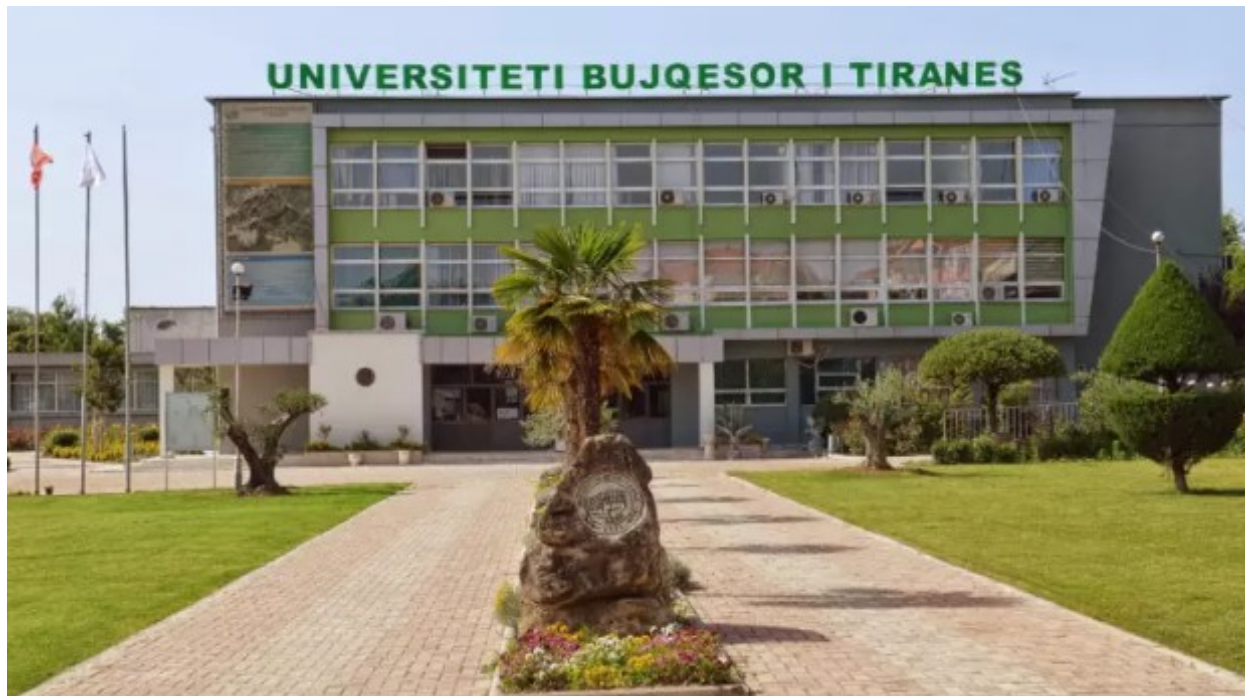
Front View of Agricultural University of Tirana (from the Entrance)

Reaching Agricultural University of Tirana (In Albanian: Universiteti Bujqësor i Tiranës) from Tirana Center ( Distance: around 7 km )