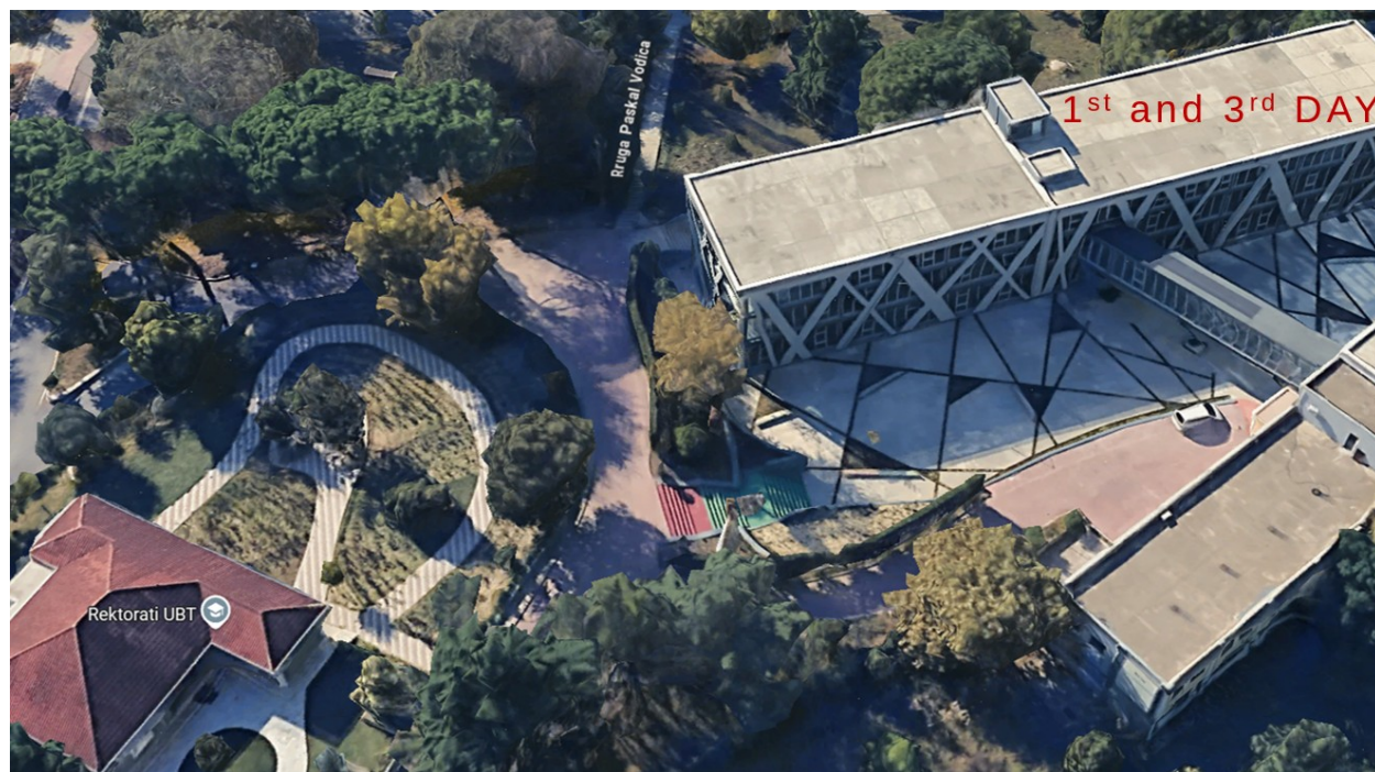
Faculty of Biotechnology and Food Building

The Event will take place at Faculty of Biotechnology and Food, Building next to Rectorate.